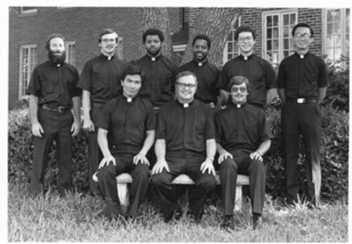
Novitiate Class of 1982 in Bay Saint Louis, MS

Dynamic Duo Battles Evil Brothers rise from ghetto to be ordained America's first black twin priests