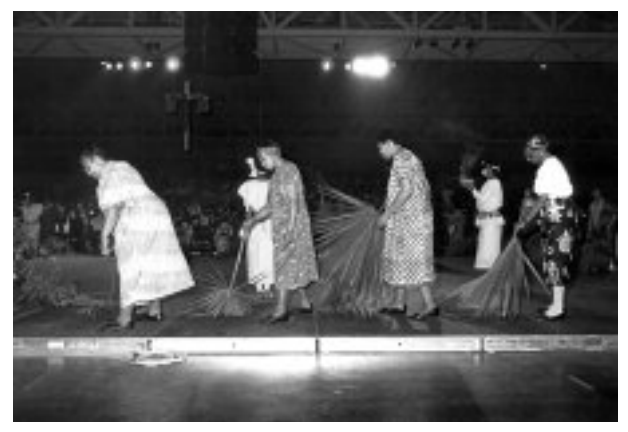
1992 Congress VII - New Orleans, LA