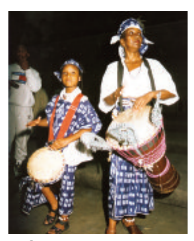
1997 Congress VIII - Baltimore, MD