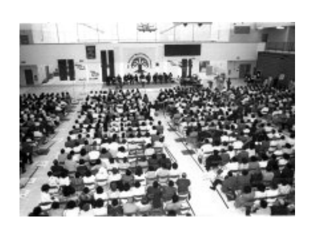
1987 Congress VI - Washington, DC