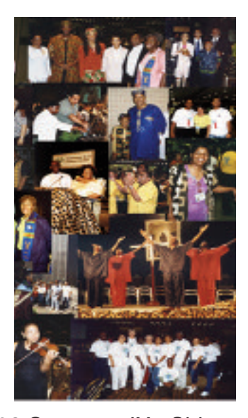
2007 Congress X - Buffalo, NY