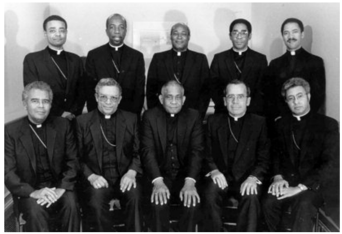
African American Bishops who authored WHAT WE HAVE SEEN AND HEARD 1984