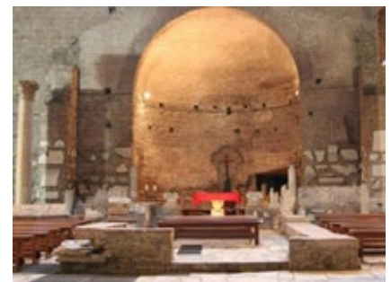
Catacombs of St. Domitilla

http://www.sedosmission.org/web/en/news/137-the-pact-of-the-catacombs-domitilla