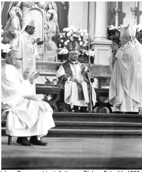
Bishop Carmon at installation as Bishop Feb. 11, 1993

Funeral Mass for Bishop Carmon was celebrated at St. Louis Cathedral by Archbishop Gregory Aymond. His burial place is in the sanctuary of St. Louis Cathedral.