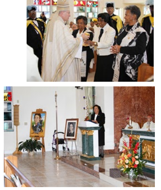
Photos on this page, previous page, and front cover are from the 175th Anniversary Mass